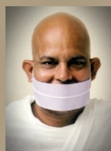
Acharya Mahashraman Ji Maharaj